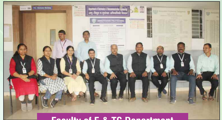
Faculty of E & TC Department